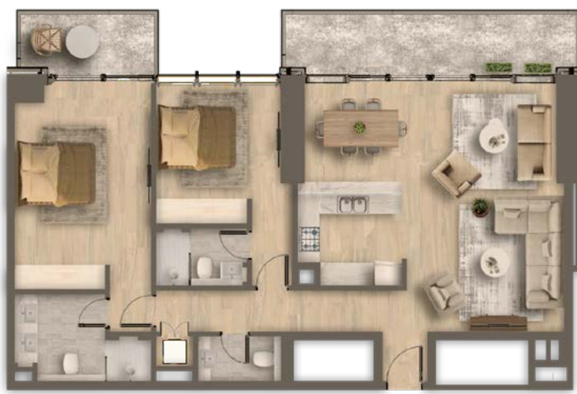
Type A 1,375 sq.ft