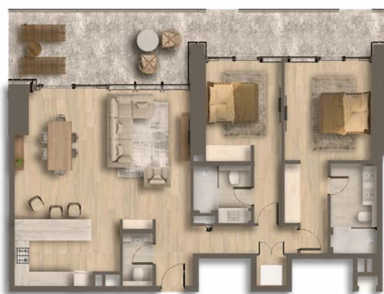
Type C1 From 1,470 sq.ft to 1,617 sq.ft