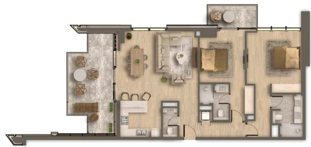
Type C From 1,321 sq.ft to 1,487 sq.ft