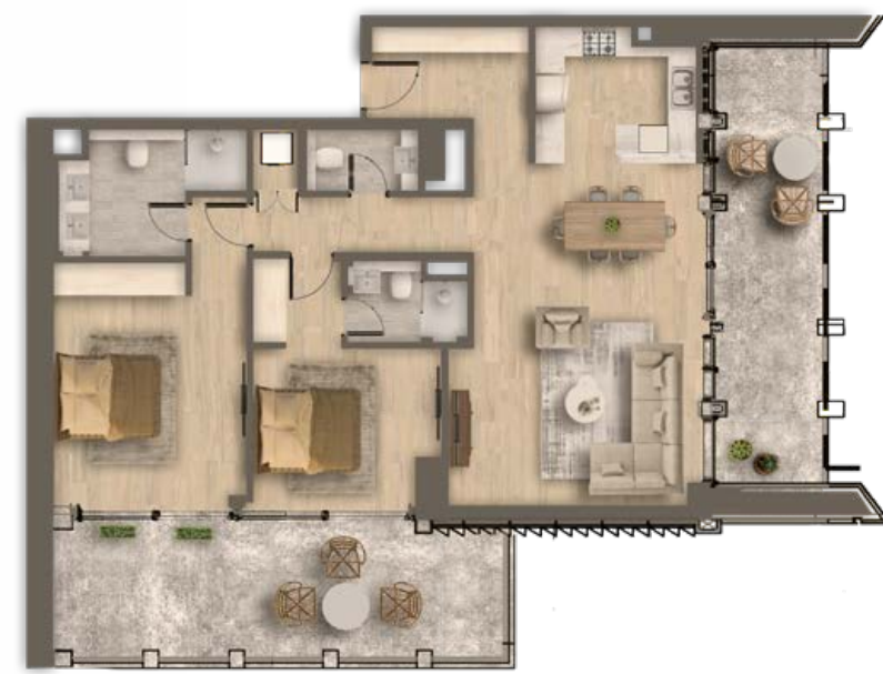
Type D From 1,275 sq.ft to 1,698 sq.ft