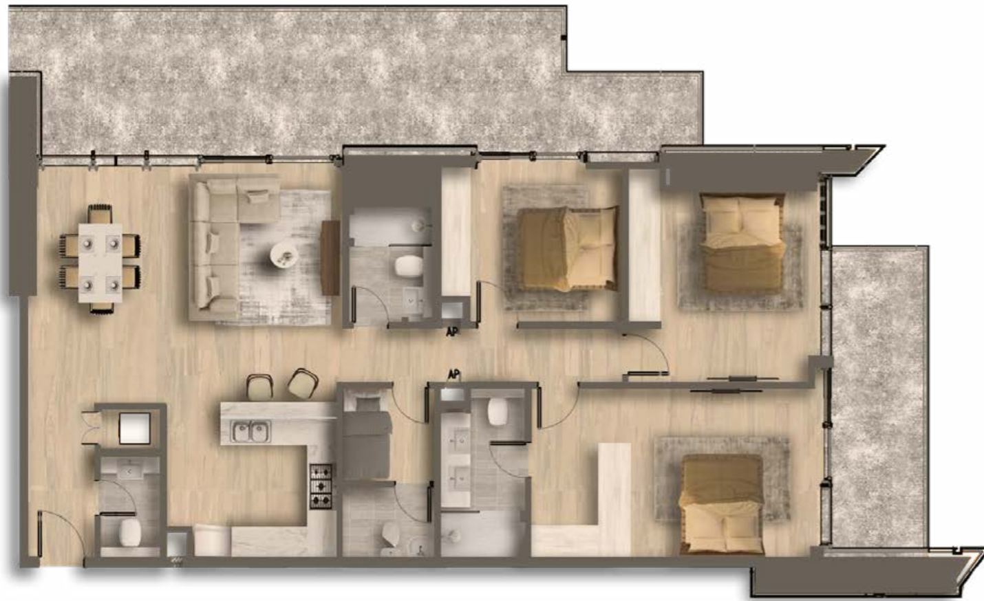
Type A From 1,674 sq.ft to 1,923 sq.ft