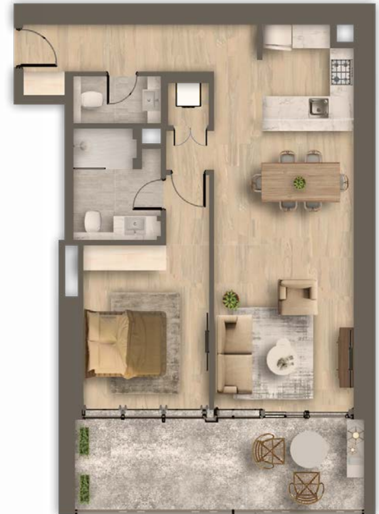
Type B1 From 996 sq.ft to 1,013 sq.ft