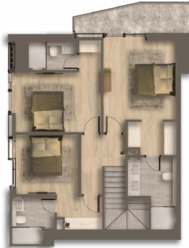
Type DP 2,344 sq.ft