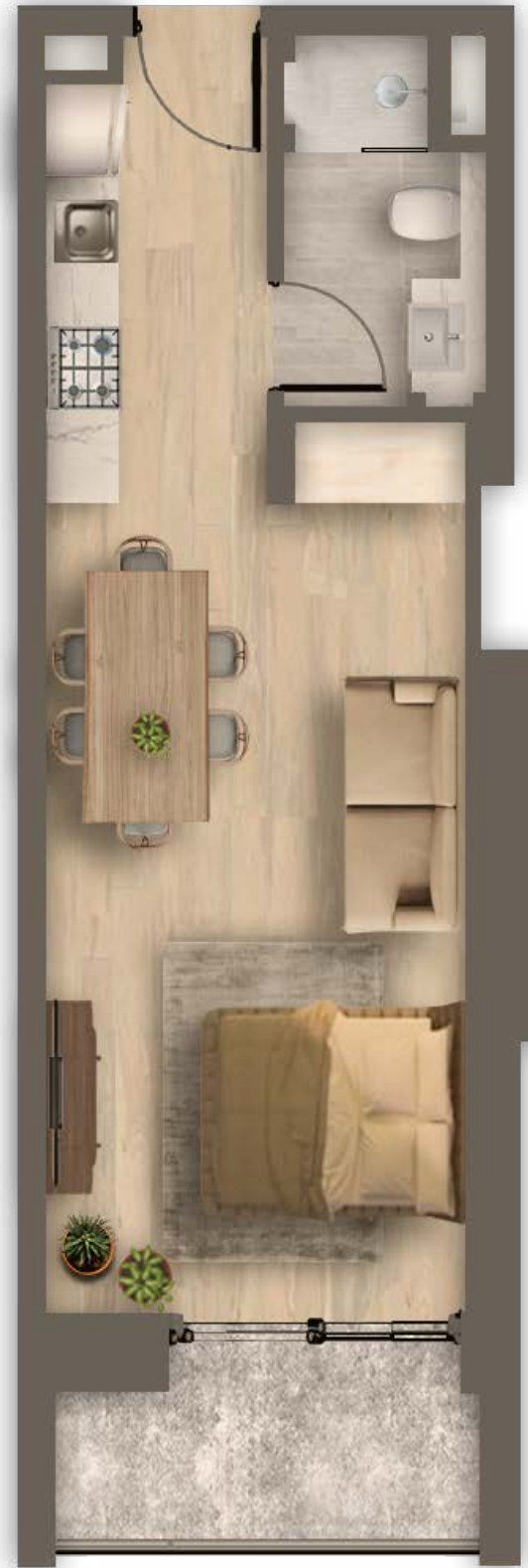
Type B 457 sq.ft