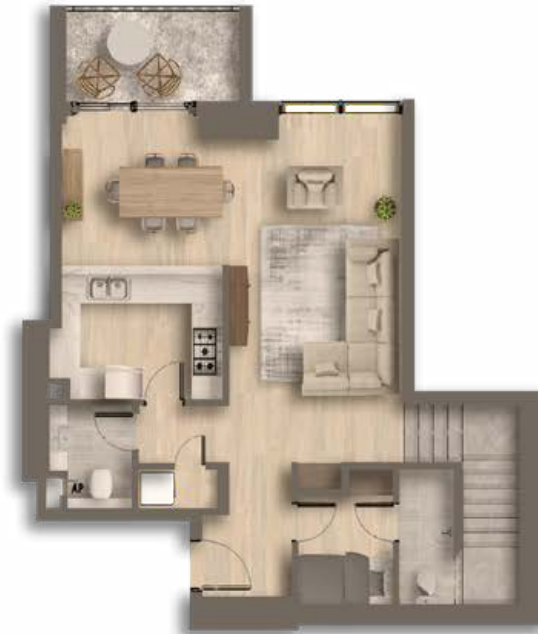
Type DPC 1,737 sq.ft