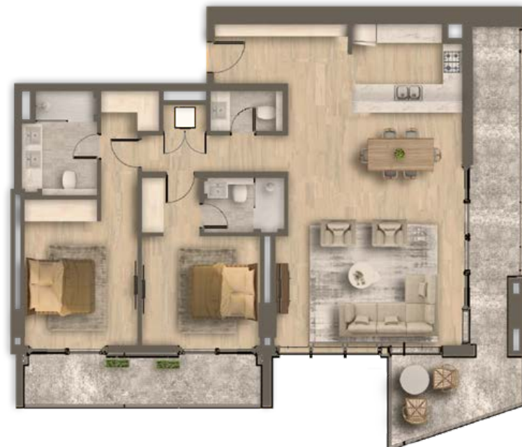
Type B From 1,467 sq.ft to 1,677 sq.ft