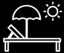
Outdoor Lounging Pool