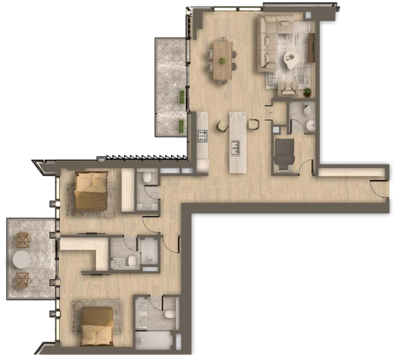
Type M From 1,595 sq.ft to 1,643 sq.ft